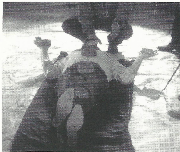
Another one of the sideshow type tricks shown at the “Fangs and Rattler” show.

ery meeting of the Wildlife & Parks Commission, recommending that KDWP reset the possession limit at 5 snakes, limit the open area to only the counties surrounding Sharon Springs, and limit the open season to the roundup weekend. Many others addressed the Commission as well, advocating moderation in light of the glaring lack of sound biological information. In spite of their testimony, each draft of the regulations proved more lenient. Furthermore, when herpetologists at-