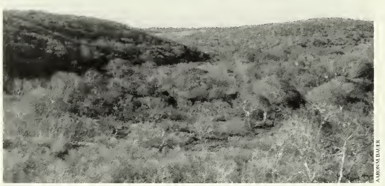
B . Sclerophyll forest habitat at Pindaï on the west central coast of New Caledonia.

The presence of this species on the Isle of Pines remains problematic. Boulenger (1878) recorded the species (as Chamaeleonurus trachycephalus ) from this locality. Subsequent collecting activity on this island, however (Bauer and Sadlier 1994a; de Vosjoli 1995) has not verified this occurrence. The unexpected findings of this and other Rhacodactylus after many years of extensive and intensive searching, however, argue against dismissal of this early record. Bauer and Sadlier (1994a) identified appropriate habitat for the species on the island.