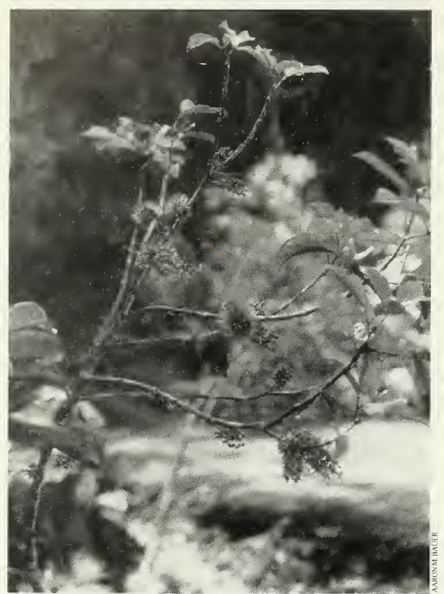
Plate 7. Geissois sp. from Mt. Do, southern New Caledonia. This plant is apparently utilized as a food source by Rhacodactylus auriculatus.

Bavay (1869) first reported on the diet of this species, indicating that it eats the flowers of Geissois (Cunoniaceae). This was verified by the recovery of anthers, stamens, and (possibly) pollen belonging to either a member of this family (or the Myrtaceae) from the stomach of one specimen (Bauer and Sadlier 1994b). On 9 January 1995 further evidence of the specific association between R. auriculatus and Geissois was obtained when geckos were found active on flowering specimens of Geissois spp. (Plate 7) 1.3-2.6 km from the summit of Mount (Mt.) Do (21°45' S, 166°00' E) in south central New Caledonia.