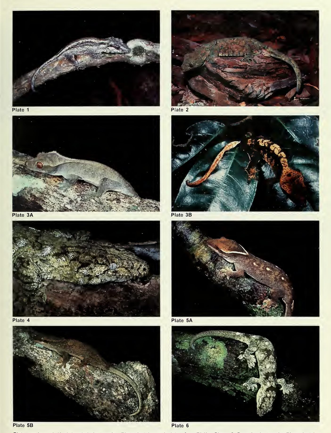
Plate captions: 1. Knob-headed giant gecko, Rhacodactylus auriculatus , from Rivière Bleue. 2. Bavay's giant gecko Rhacodactylus chahoua. 3A. Guichenot's giant gecko, Rhacodactylus ciliatus , from Rivière Bleue (adult with autotomized tail). 3B. Rhacodactylus ciliatus , from Rivière Bleue (subadult with complete original tail and complex body patterning). 4. Leach's giant gecko, Rhacodactylus leachianus , from Mt. Koghis. 5A. Roux's giant gecko, Rhacodactylus sarasinorum , from Kwa Néie (adult retaining bold white dorsal markings). 5B. Rhacodactylus sarasinorum , from Rivière Bleue (adult with mottled dorsal pattern). 6. Rough-snouted giant gecko Rhacodactylus trachyrhynchus , from Mt. Aoupinié.