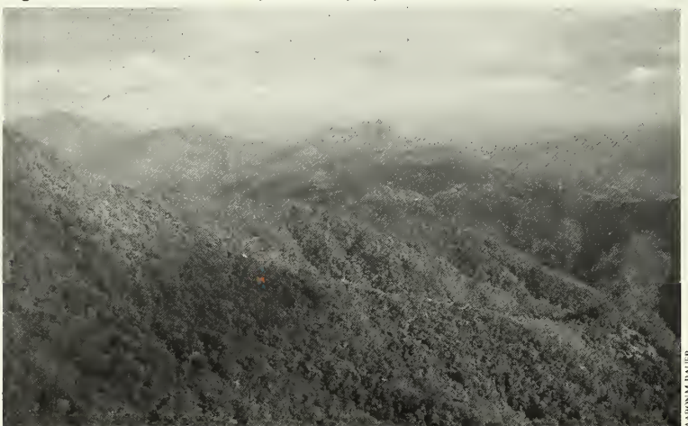
A. Overview of humid forest habitat at middle elevation on Mt. Aoupinié.