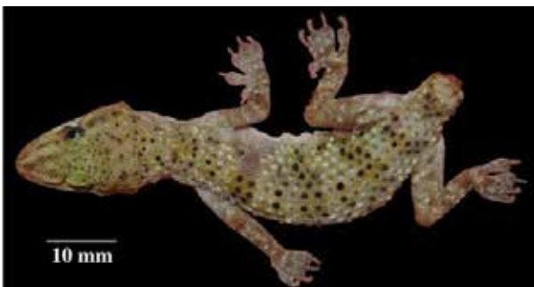
Figure 3. A specimen of H. persicus with autotomized tail from Shiraz, the capital of Fars Province.