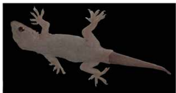
Figure 4. A new specimen of H. flaviviridis from southwest of Fars Province.