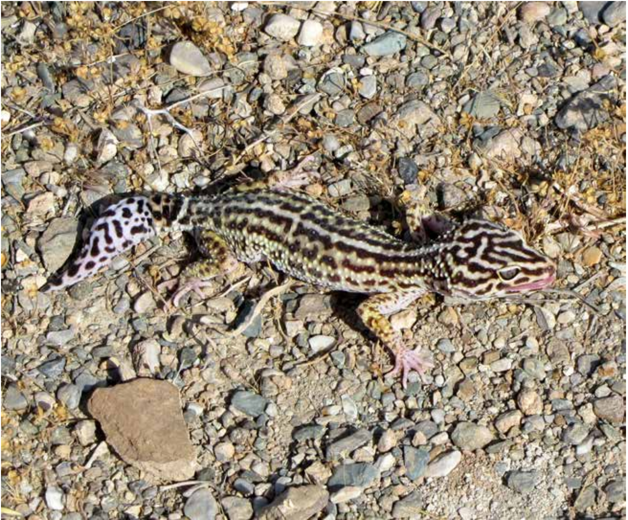
Figure 1. Eublepharis angramainyu .