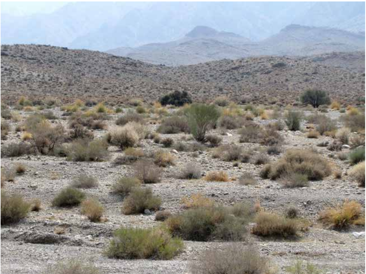
Figure 2. Habitat of Eublepharis angramainyu .

Western specimens seen in the wild were found in rocky deserts and arid grasslands. They occur in the small caverns in the gypsum deposits (Karamiani et al. 2010). The habitats are similar despite the wide distances between localities except for elevational range (1868 m instead of 300-1427 m).