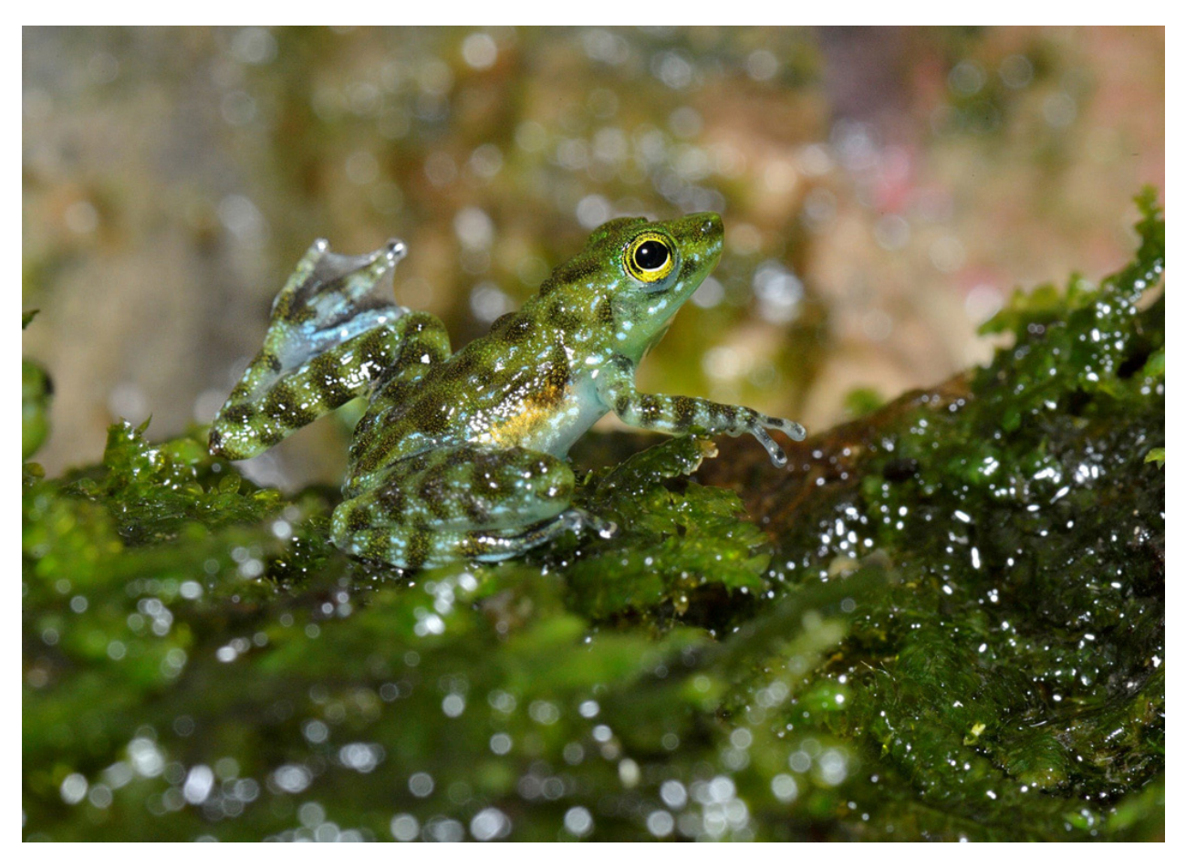
Figure 10. Juvenile Staurois parvus performing a foot-flagging behavior. Interdigital webbing are transparent grey and not white as observed in adults (see also Fig. 2).