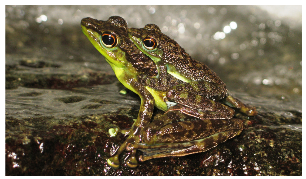
Figure 1. Male and female Staurois guttatus in amplexus resting at a waterfall.

Many stream living anuran species in Borneo show morphological and behavioral adaptations to torrential streams and waterfalls. For example, the tadpoles of Huia cavitympanum and of all species of the genus Meristogenys have large abdominal suckers specialized for a life in currents (Haas and Das 2012). The adult males of M. orphnocnemis use high frequency calls to communicate in noisy stream environments (Boeckle et al. 2009; Preininger et al. 2007). An extraordinary spectral adaptation to enhance the signal-to-noise ratio has also been reported in Huia cavitympanum, in which males call in a band of ultrasonic frequencies (Arch et al. 2008). In the vicinity of waterfalls and fast-flowing streams, species of the genus Staurois display an exceptional behavior termed, "foot-flagging" (Grafe et al. 2012; Grafe and Wanger 2007; Preininger et al. 2009). The conspicuous visual display mainly observed in tropical anuran species inhabiting riparian habitats (reviewed in Hödl and Amézquita 2001) may act as a complementary mode of communication in noisy habitats.