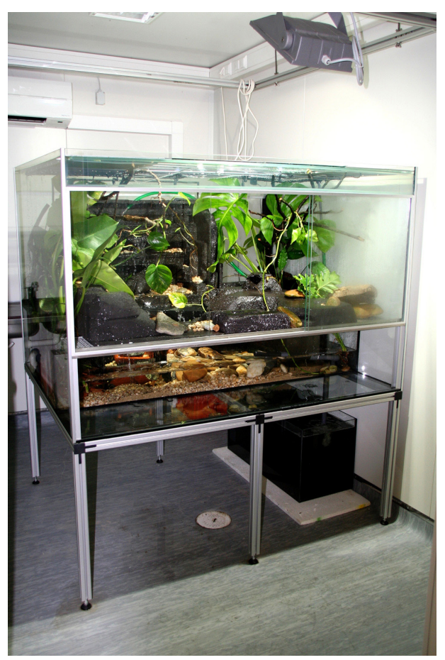
Figure 5. Ex situ breeding facility designed to offer different egg deposition sites (described in detail in the Methods section).