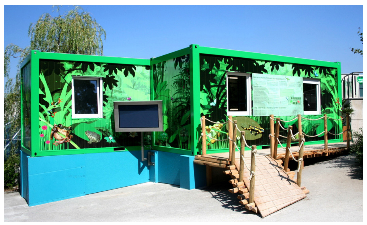
Figure 4. The bio-secure container facility a modern Noah's Ark, which houses Staurois guttatus and S. parvus at the Vienna Zoo Schönbrunn.