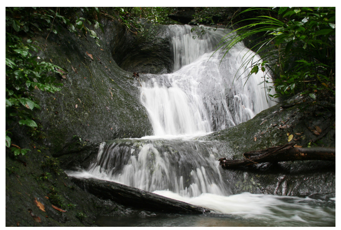
Figure 3. A waterfall habiat of Staurois guttatus at the Sungai Mata Ikan ("Fish-Eye" River) in the Temborong District in Brunei, Borneo.

Aglaonema sp., Scindapsus sp., and others) as nightly resting sites. We incorporated a self-built rain and misting system to simulate rainy and dry periods. The water area, which covered the entire floor of the terrarium, was filled with gravel of different grain sizes and larger pebbles that provided perching sites and interstitial spaces. We further installed two smaller glass containers (30 \times 30 \times 30 cm), one placed directly under the waterfall mimicking a constantly flushed pool with large stones, and the other containing sand, dead leaves, and standing water, as found in side ponds of waterfalls. A mixture of osmosis-purified water and drinking water (average conductivity = 9 \mu S/cm, pH = 7.2) was discharged via the waterfall and drained into an external filter reservoir, which created a slow current in the main water area. As light source we used a metal-halide lamp (HIT-DE 70 Watt [Daylight]) and placed several plastic boards on top of the terrarium to mimic canopy coverage. Individuals were housed under 12-hour light, 12-hour dark cycles. We placed five pairs of S. parvus into the arena. From then on individuals could only be counted at night when perching on leaves, while frogs rested in the many hiding places during the day.