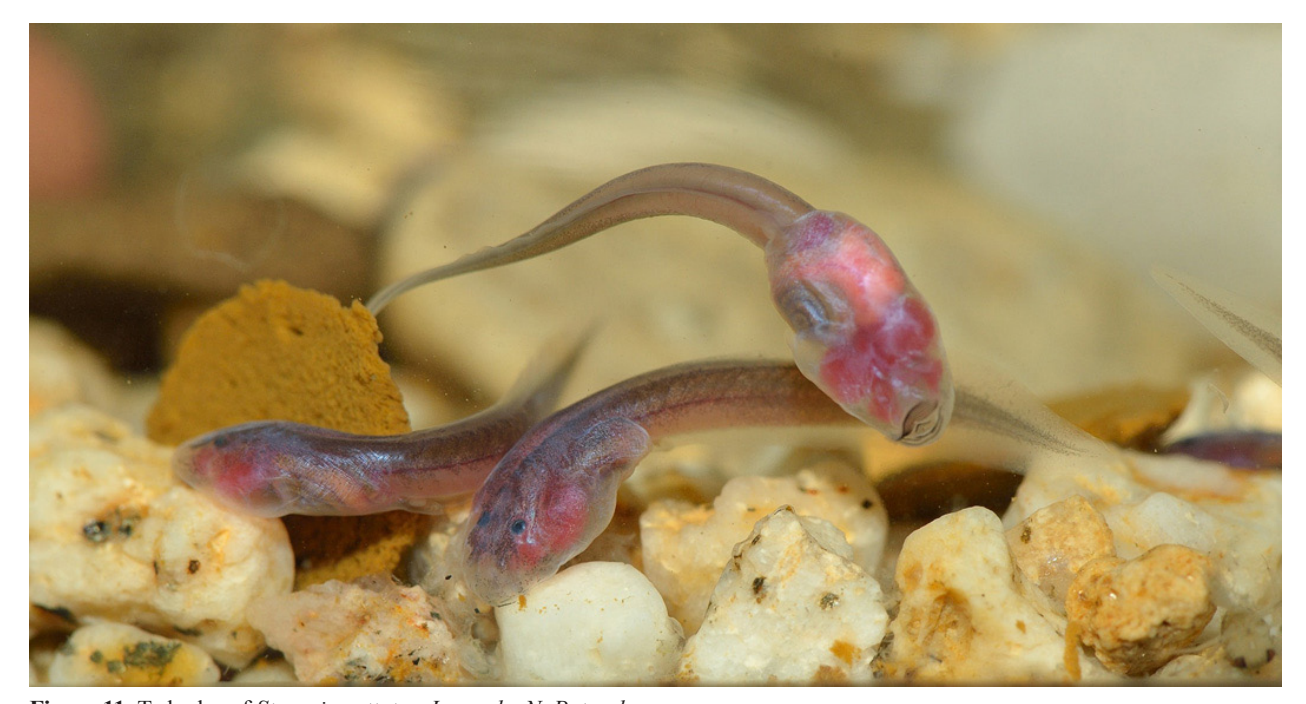
Figure 11. Tadpoles of Staurois guttatus.