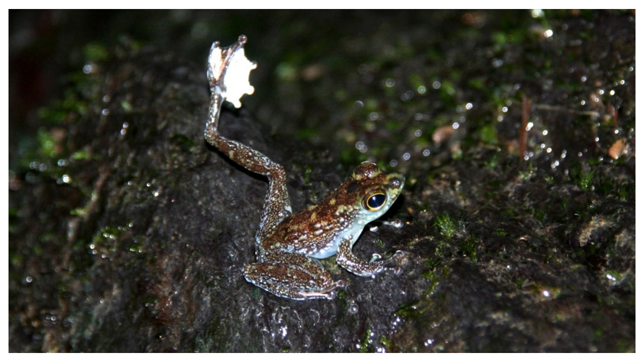
Figure 2. A male of Staurois parvus displaying the white interdigital webbing during foot-flagging behavior. The visual signals are mainly employed during male-male agonistic interactions.