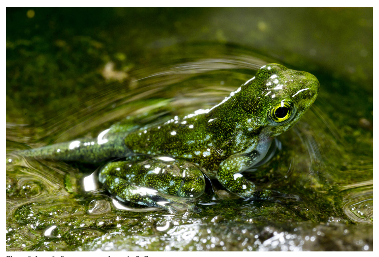
Figure 8. Juvenile Staurois parvus.

The diversely structured artificial habitat in the breeding tank offered individuals similar conditions as observed in the natural habitat. Earlier studies that kept adults of S. parvus in terrariums of simpler design (no flowing water) showed that individuals did not display acoustic or visual signals under such conditions (R. Kasah, pers. comm.). At the beginning of our project we kept individuals pair-wise in simpler terraria with a small water area containing no gravel and only larger pebbles, some tree branches, flowing water via a pump, and temperatures of 23-25 °C. Under these conditions individuals performed advertisement calls and foot-flagging behavior but no reproductive behavior could be observed. Especially in S. guttatus females displayed territorial calls and foot flags if males approached, a behavior that was interpreted as a spacing mechanism (Preininger et al., data not shown). After transferring all individuals in the considerably larger and diversely structured breeding tank, calling activity intensified, and pairs in amplexus could be observed after a few weeks. Hence, we suggest that first and foremost the gravel containing flowing water area was crucial for reproduction, but also the simulated dry and rainy season might have had an effect. It is now essential to alter or exclude single environmental conditions or habitat structures to determine factors necessary for reproduction. So far we have removed the artificial side pool and flushed