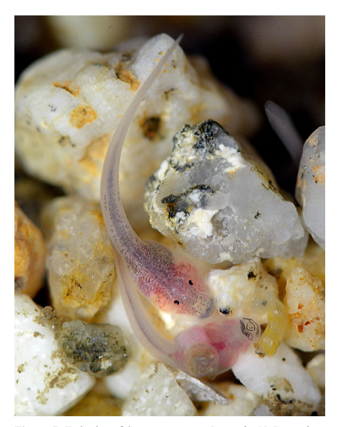
Figure 7. Tadpoles of Staurois parvus.

The diversely structured artificial habitat in the breeding tank offered individuals similar conditions as observed in the natural habitat. Earlier studies that kept adults of S. parvus in terrariums of simpler design (no flowing water) showed that individuals did not display acoustic or visual signals under such conditions (R. Kasah, pers. comm.). At the beginning of our project we kept individuals pair-wise in simpler terraria with a small water area containing no gravel and only larger pebbles, some tree branches, flowing water via a pump, and temperatures of 23-25 °C. Under these conditions individuals performed advertisement calls and foot-flagging behavior but no reproductive behavior could be observed. Especially in S. guttatus females displayed territorial calls and foot flags if males approached, a behavior that was interpreted as a spacing mechanism (Preininger et al., data not shown). After transferring all individuals in the considerably larger and diversely structured breeding tank, calling activity intensified, and pairs in amplexus could be observed after a few weeks. Hence, we suggest that first and foremost the gravel containing flowing water area was crucial for reproduction, but also the simulated dry and rainy season might have had an effect. It is now essential to alter or exclude single environmental conditions or habitat structures to determine factors necessary for reproduction. So far we have removed the artificial side pool and flushed