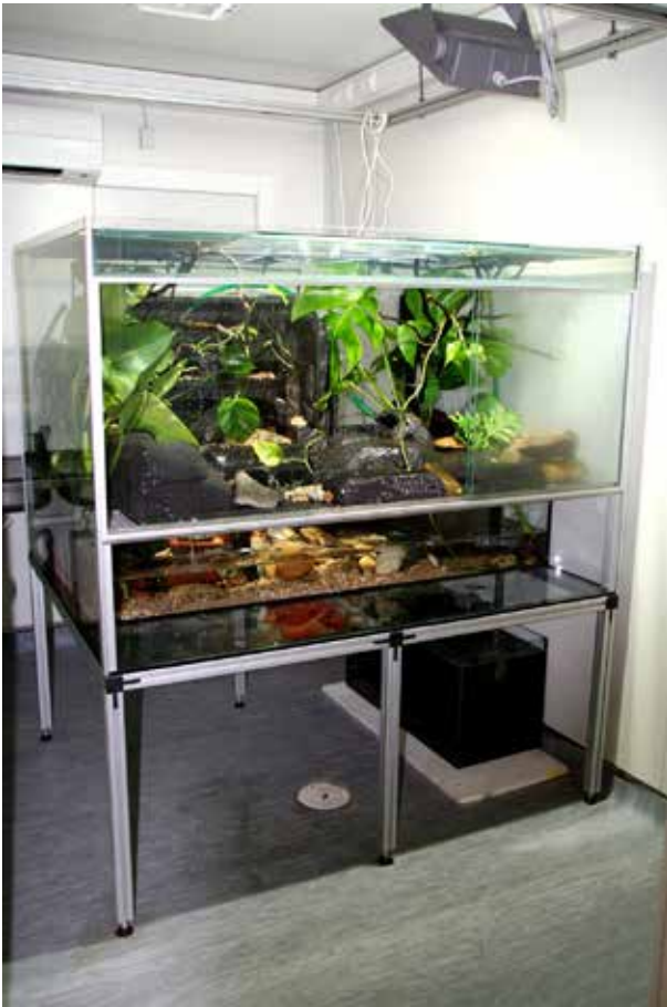
Figure 5. Ex situ breeding facility designed to offer different egg deposition sites (described in detail in the Methods section).