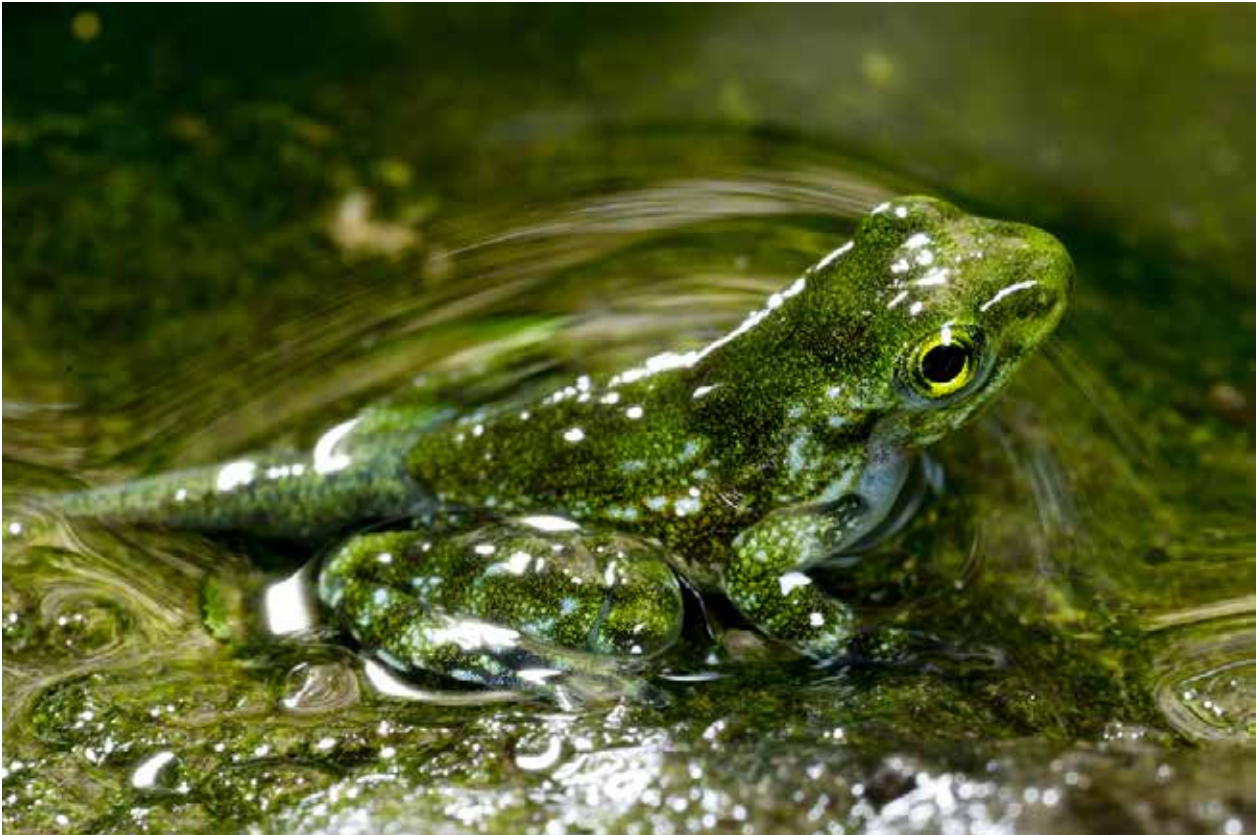
Figure 8. Juvenile Staurois parvus .

The diversely structured artificial habitat in the breeding tank offered individuals similar conditions as observed in the natural habitat. Earlier studies that kept adults of S. parvus in terrariums of simpler design (no flowing water) showed that individuals did not display acoustic or visual signals under such conditions (R. Kasah, pers. comm.). At the beginning of our project we kept individuals pair-wise in simpler terraria with a small water area containing no gravel and only larger pebbles, some tree branches, flowing water via a pump, and temperatures of 23-25 °C. Under these conditions individuals performed advertisement calls and foot-flagging behavior but no reproductive behavior could be observed. Especially in S. guttatus females displayed territorial calls and foot flags if males approached, a behavior that was interpreted as a spacing mechanism (Preininger et al., data not shown). After transferring all individuals in the considerably larger and diversely structured breeding tank, calling activity intensified, and pairs in amplexus could be observed after a few weeks. Hence, we suggest that first and foremost the gravel containing flowing water area was crucial for reproduction, but also the simulated dry and rainy season might have had an effect. It is now essential to alter or exclude single environmental conditions or habitat structures to determine factors necessary for reproduction. So far we have removed the artificial side pool and flushed