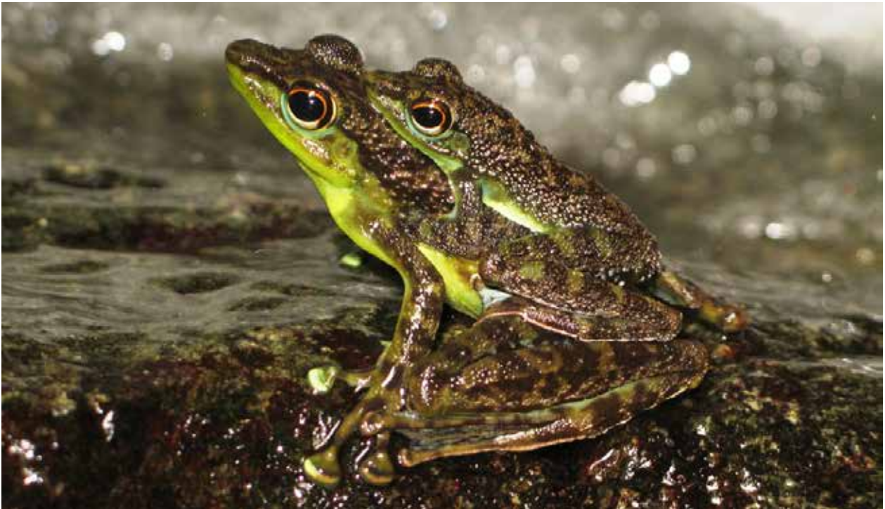
Figure 1. Male and female Staurois guttatus in amplexus resting at a waterfall.

Many stream living anuran species in Borneo show morphological and behavioral adaptations to torrential streams and waterfalls. For example, the tadpoles of Huia cavitympanum and of all species of the genus Meristogenys have large abdominal suckers specialized for a life in currents (Haas and Das 2012). The adult males of M. orphnocnemis use high frequency calls to communicate in noisy stream environments (Boeckle et al. 2009; Preininger et al. 2007). An extraordinary spectral adaptation to enhance the signal-to-noise ratio has also been reported in Huia cavitympanum , in which males call in a band of ultrasonic frequencies (Arch et al. 2008). In the vicinity of waterfalls and fast-flowing streams, species of the genus Staurois display an exceptional behavior termed, “foot-flagging” (Grafe et al. 2012; Grafe and Wanger 2007; Preininger et al. 2009). The conspicuous visual display mainly observed in tropical anuran species inhabiting riparian habitats (reviewed in Hödl and Amézquita 2001) may act as a complementary mode of communication in noisy habitats.