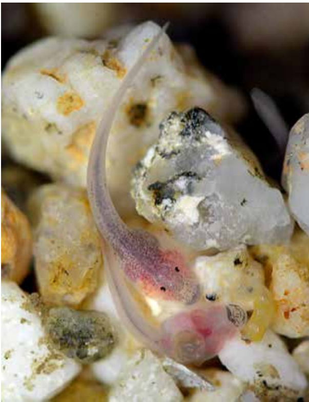
Figure 7. Tadpoles of Staurois parvus .

The diversely structured artificial habitat in the breeding tank offered individuals similar conditions as observed in the natural habitat. Earlier studies that kept adults of S. parvus in terrariums of simpler design (no flowing water) showed that individuals did not display acoustic or visual signals under such conditions (R. Kasah, pers. comm.). At the beginning of our project we kept individuals pair-wise in simpler terraria with a small water area containing no gravel and only larger pebbles, some tree branches, flowing water via a pump, and temperatures of 23-25 °C. Under these conditions individuals performed advertisement calls and foot-flagging behavior but no reproductive behavior could be observed. Especially in S. guttatus females displayed territorial calls and foot flags if males approached, a behavior that was interpreted as a spacing mechanism (Preininger et al., data not shown). After transferring all individuals in the considerably larger and diversely structured breeding tank, calling activity intensified, and pairs in amplexus could be observed after a few weeks. Hence, we suggest that first and foremost the gravel containing flowing water area was crucial for reproduction, but also the simulated dry and rainy season might have had an effect. It is now essential to alter or exclude single environmental conditions or habitat structures to determine factors necessary for reproduction. So far we have removed the artificial side pool and flushed