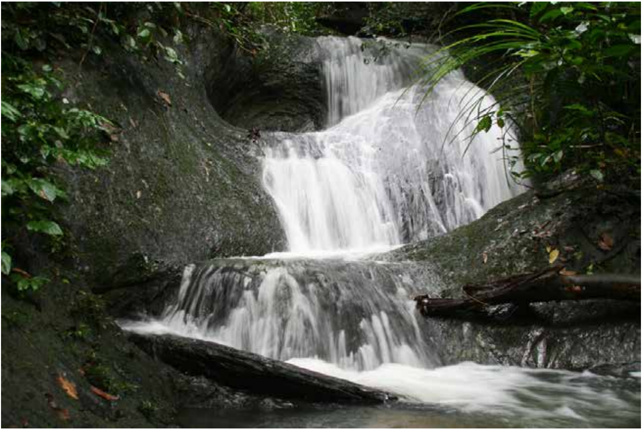
Figure 3. A waterfall habitat of Staurois guttatus at the Sungai Mata Ikan (“Fish-Eye” River) in the Temborong District in Brunei, Borneo.

Aglaonema sp., Scindapsus sp., and others) as nightly resting sites. We incorporated a self-built rain and misting system to simulate rainy and dry periods. The water area, which covered the entire floor of the terrarium, was filled with gravel of different grain sizes and larger pebbles that provided perching sites and interstitial spaces. We further installed two smaller glass containers (30 × 30 × 30 cm), one placed directly under the waterfall mimicking a constantly flushed pool with large stones, and the other containing sand, dead leaves, and standing water, as found in side ponds of waterfalls. A mixture of osmosis-purified water and drinking water (average conductivity = 9 μS/cm, pH = 7.2) was discharged via the waterfall and drained into an external filter reservoir, which created a slow current in the main water area. As light source we used a metal-halide lamp (HIT-DE 70 Watt [Daylight]) and placed several plastic boards on top of the terrarium to mimic canopy coverage. Individuals were housed under 12-hour light, 12-hour dark cycles. We placed five pairs of S. parvus into the arena. From then on individuals could only be counted at night when perching on leaves, while frogs rested in the many hiding places during the day.