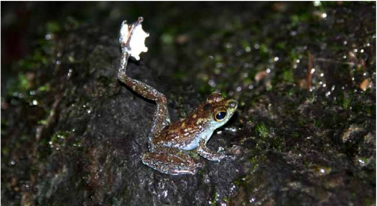
Figure 2. A male of Staurois parvus displaying the white interdigital webbing during foot-flagging behavior. The visual signals are mainly employed during male-male agonistic interactions.