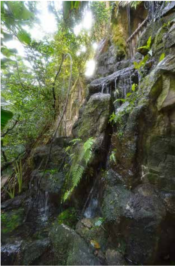
Figure 9. Artificial waterfall habitat at the Borneo Rainforest-house in the Vienna Zoo.

pool from the S. parvus breeding terrarium and still observe freshly hatched tadpoles.