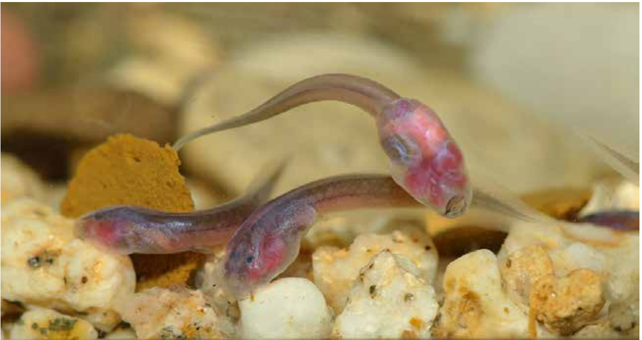
Figure 11. Tadpoles of Staurois guttatus .