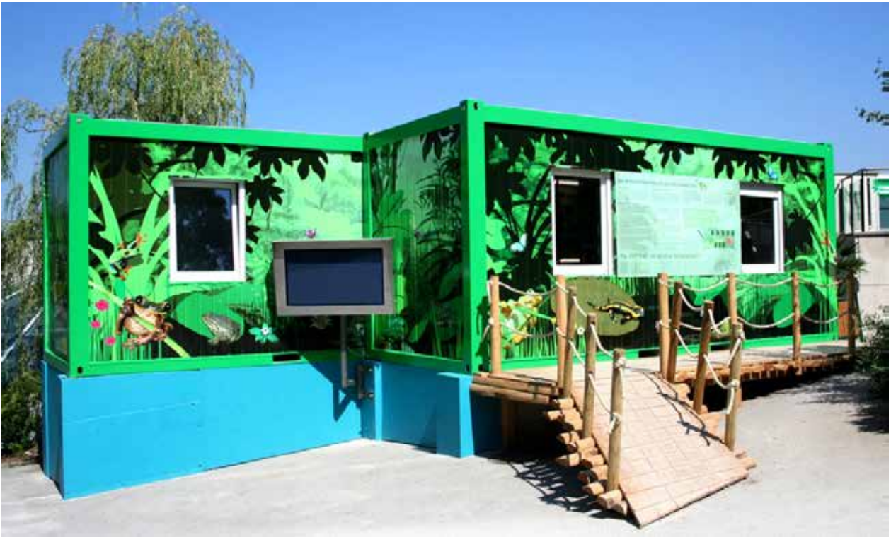
Figure 4. The bio-secure container facility a modern Noah's Ark, which houses Staurois guttatus and S. parvus at the Vienna Zoo Schönbrunn.