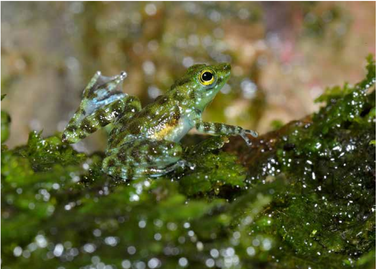
Figure 10. Juvenile Staurois parvus performing a foot-flagging behavior. Interdigital webbing are transparent grey and not white as observed in adults (see also Fig. 2).