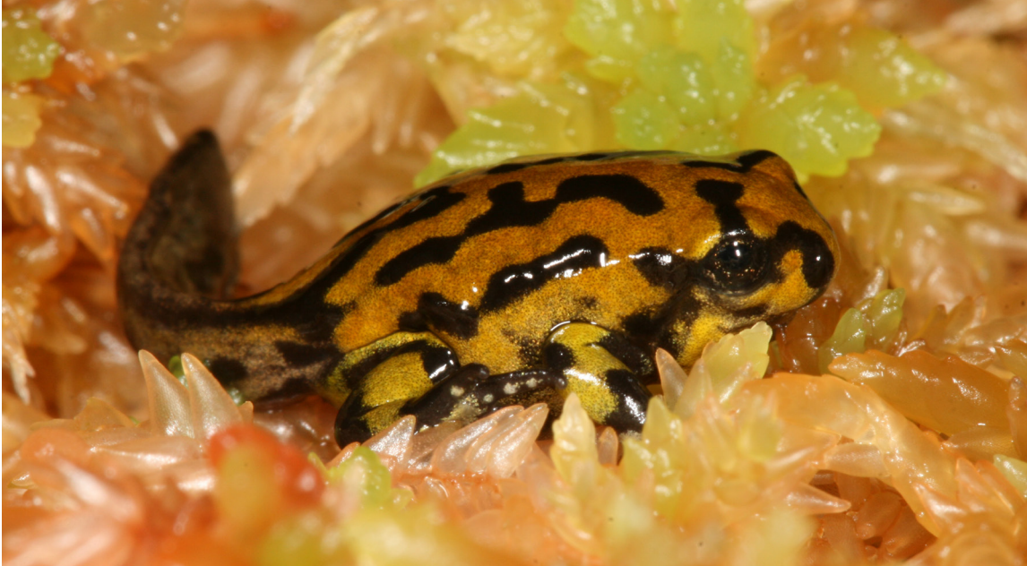
Fig. 7. Metamorphosing Southern Corroboree Frog.