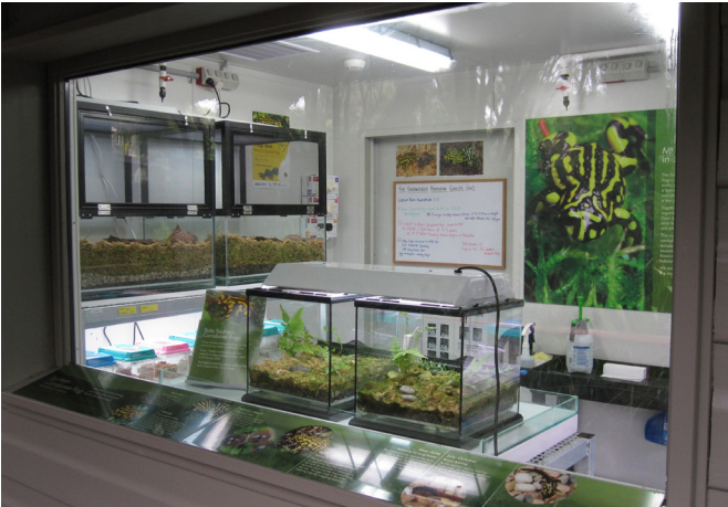
Fig. 2. Endangered amphibian complex at Melbourne Zoo.