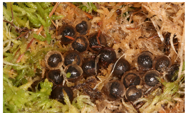
Fig. 6. Southern Corroboree Frog eggs.

At both zoos, male frogs can be heard calling at two years of age, though most males matured at three to four years. Earliest female breeding at TZ was from a single three year old frog from 19 individual females in this age group.