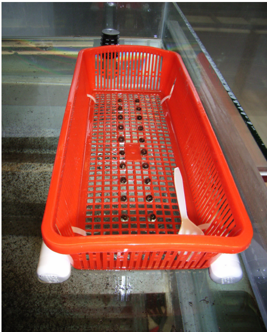
Fig. 4. Floating hatching tray on a tadpole rearing tank.

from the bottom of natural pools within the species' habitat. Prior to use, the silt was heated to 40 °C for 24 hours to kill chytrid fungus zoospores (Johnson et al. 2003), a process which still allows algae to survive and grow. As well as feeding on algae, tadpoles were offered a diet of frozen endive twice per week and a 75:25 mixture of finely-powdered Sera Flora and Sera Sans fish flakes, three to four times per week. This tadpole diet has been utilized at TZ since 2007, with the heat-treated natural silt first added to tadpole rearing tanks at MZ during the 2009 breeding season. Prior to that, only endive was offered. In 2012, MZ also added finely crushed spirulina wafers.