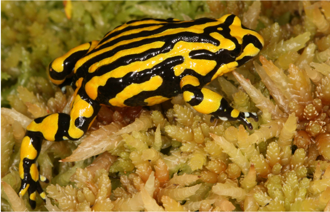
Fig. 1. Adult Southern Corroboree Frog.