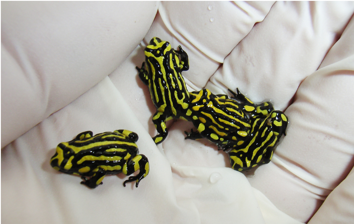
Fig. 8. Southern Corroboree Frog metamorphs.