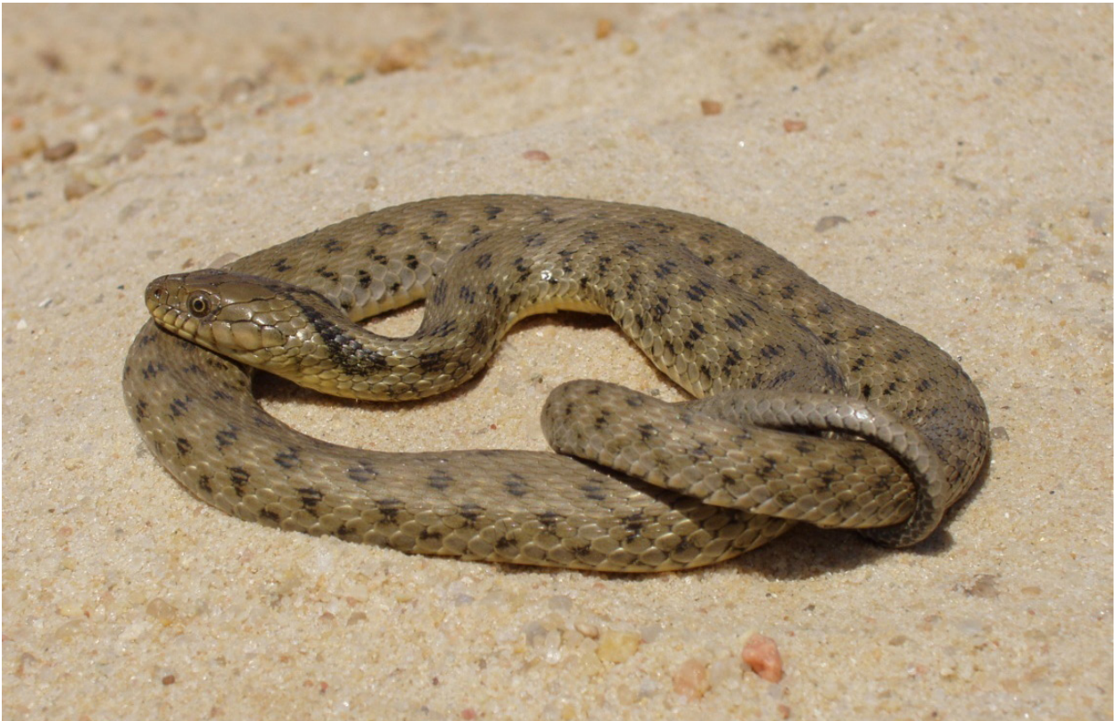
Figure 1. Natrix tessellata , Ismailia city, 7 August 2007.