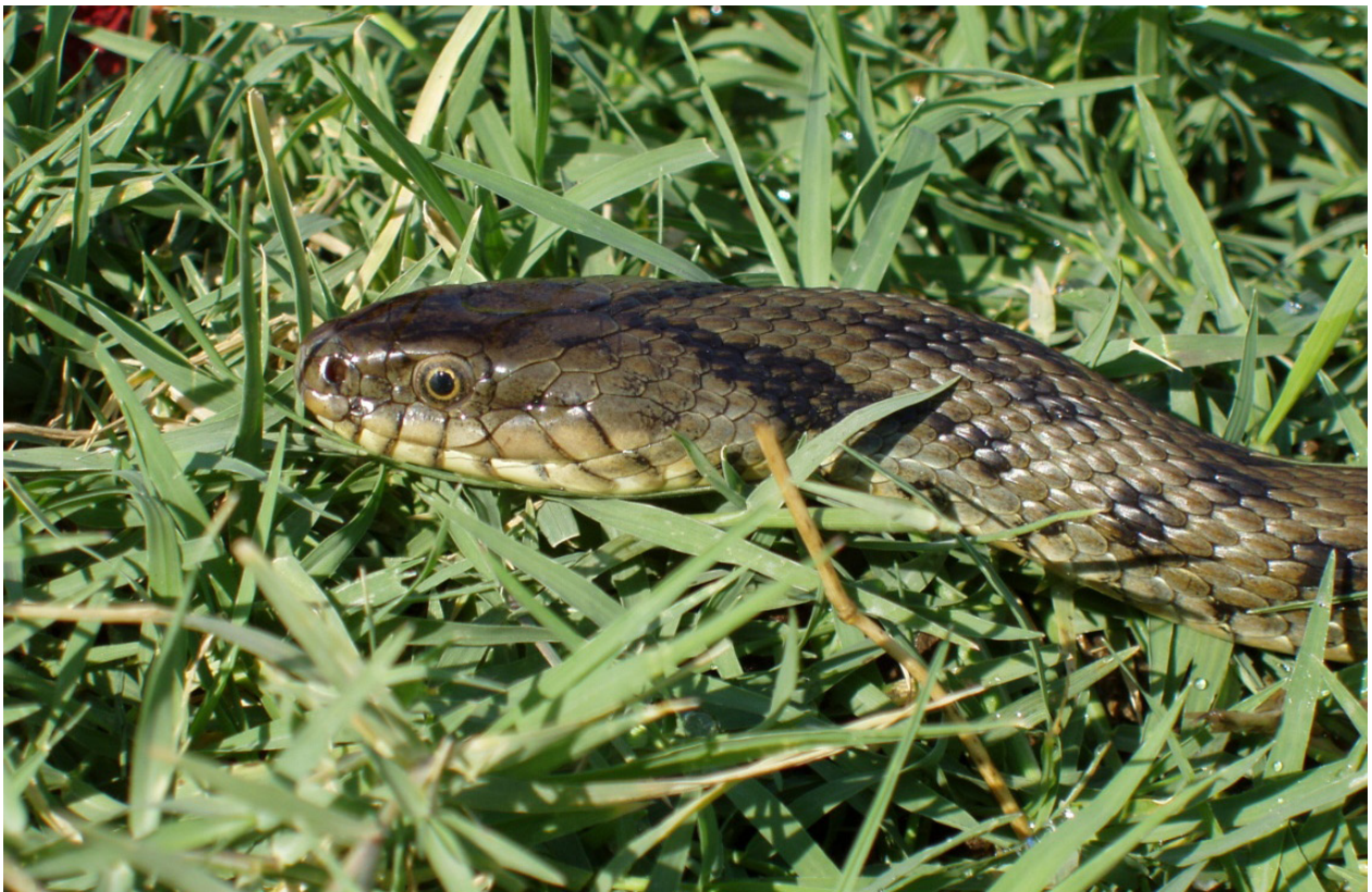
Figure 2. Natrix tessellata , Déversoir, 24 May 2008.